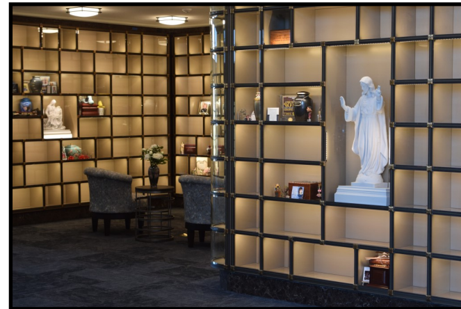
A member of The International Cemetery & Funeral Association & The New Jersey Cemetery Association

We have completed a detailed inventory of our grounds and Mausoleums. If you would like to know if there is space available near your loved one, please call one of our family service advisors at (856) 829-3553.